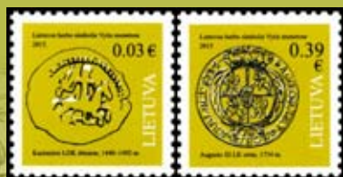
No. 691A, 694A