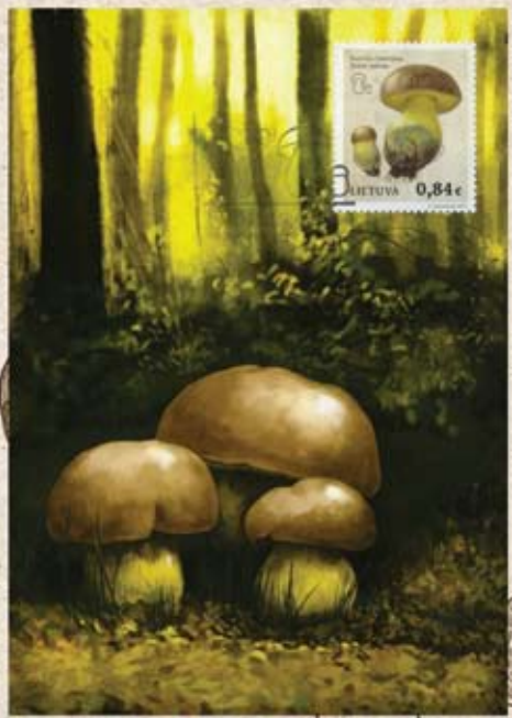
Maximum cards No. 70 – 71