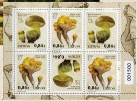
Booklet No. 1