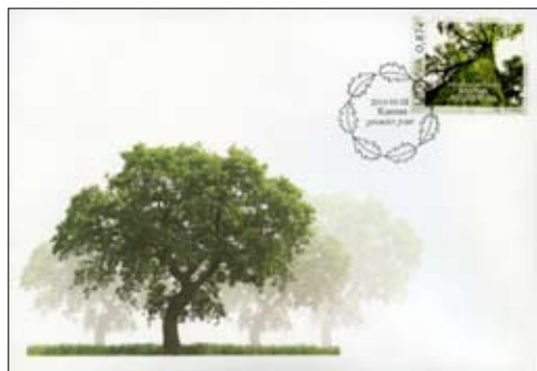
PDV (FDC 2016-6)