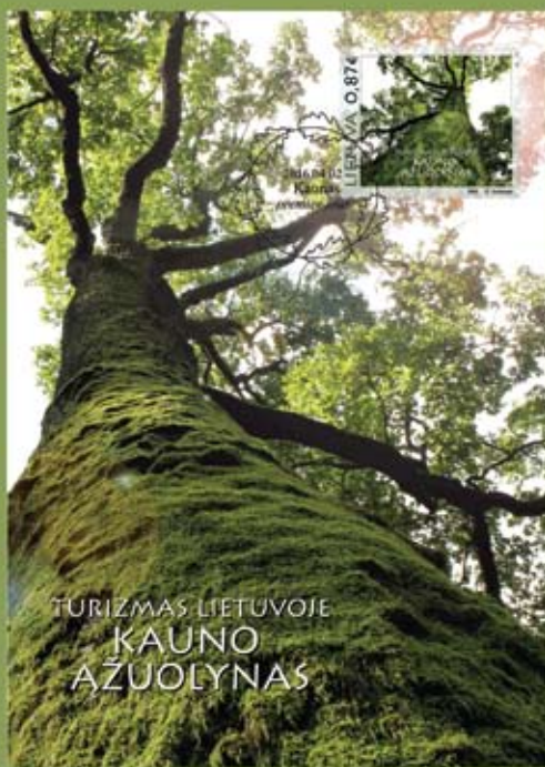
Maximum Card No. 72