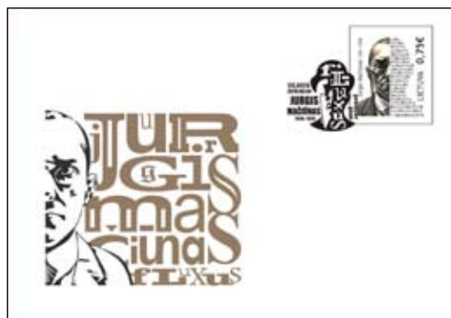
PDV (FDC 2016–9)