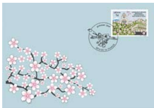
PDV (FDC 2016–7)

In 1922 Japan recognized the Independence of Lithuania. Japanese Consulate was opened in Kaunas before the Second War. Mr. Chiune Sugihara served as Vice Consul. During World War II, he helped Jews to leave the country by issuing transit visas or Visas of Life so that they could travel to Japanese territory. Japan recognized Lithuania as an independent state again in September, 1991. Diplomatic relations between Lithuania and Japan was restored on October 10, 1991.