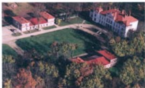
ROKIŠKIO KRAŠTO MUZIEJUS