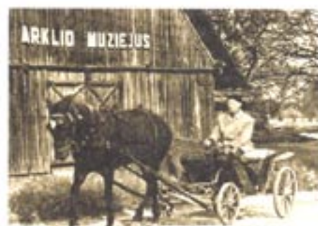
ARKLIO MUZIEJUI-30 METŲ