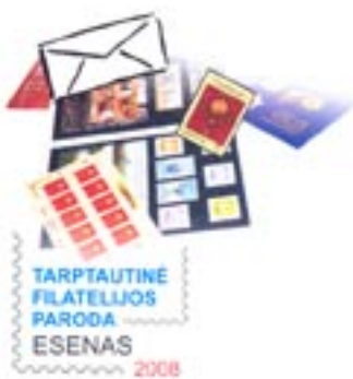
TARPTAUTINĖ FILATELIJOS PARODA ESENAS 2008