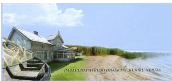
PASAULIO PAVELDO OBJEKTAI. KURŠIŲ NERIJA