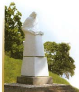
2012 METAI - MUZIEJU METAI DIONIZO POŠKOS BAUBLIAI