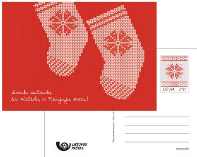
ZA 11 2,45 Lt – Christmas socks.

Edition: 0,010 million each postal card. Printed in Joint Stock Company "Petro ofsetas".