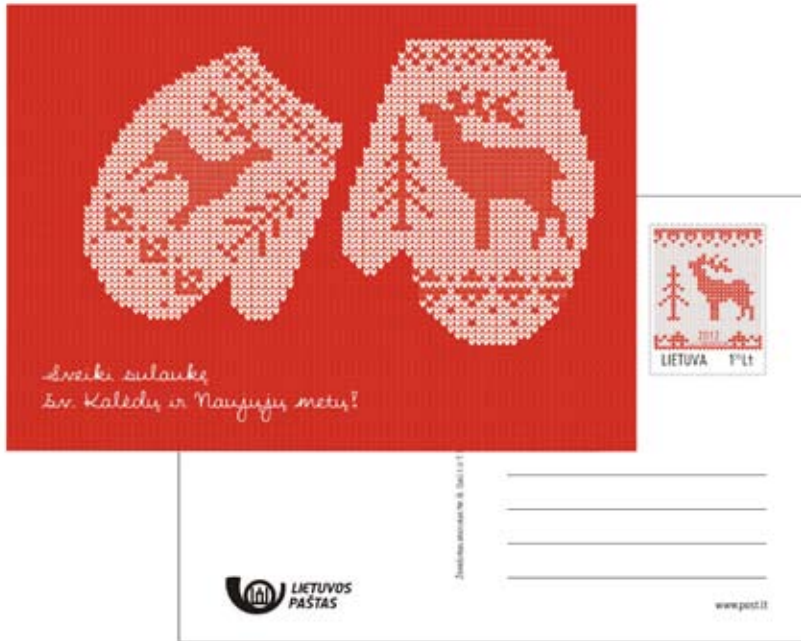
ZA 8 1,35 Lt – Christmas gloves.

In the picture – Christmas gloves (ZA 8), Christmas gloves(ZA 9), Christmas socks (ZA 10), Christmas socks (ZA 11).