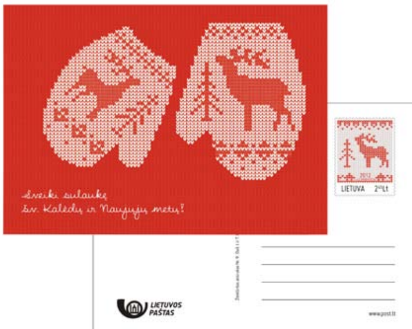
ZA 9 2,45 Lt – Christmas gloves.