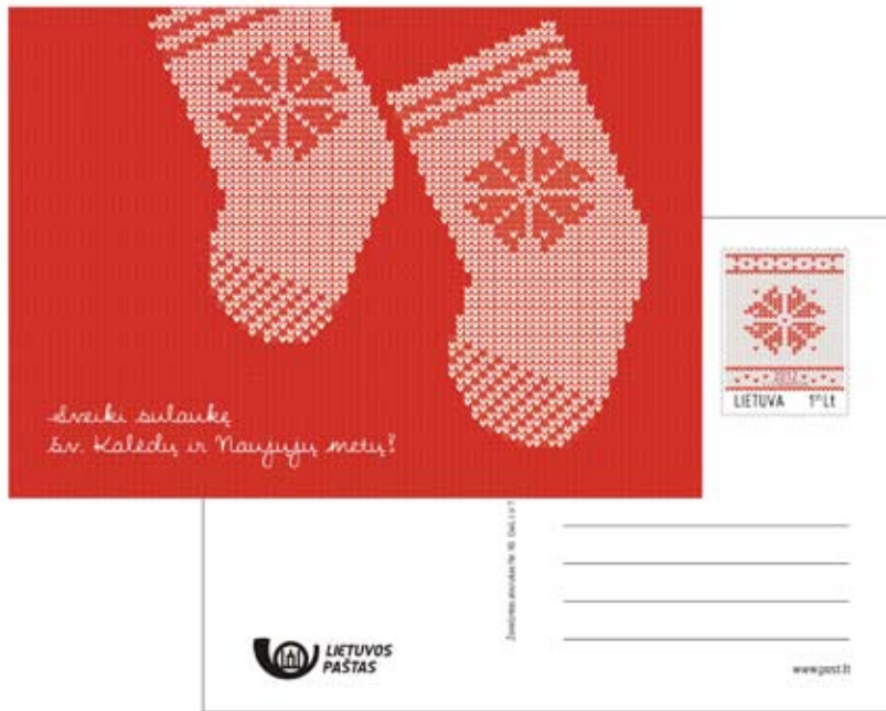
ZA 10 1,35 Lt – Christmas socks.